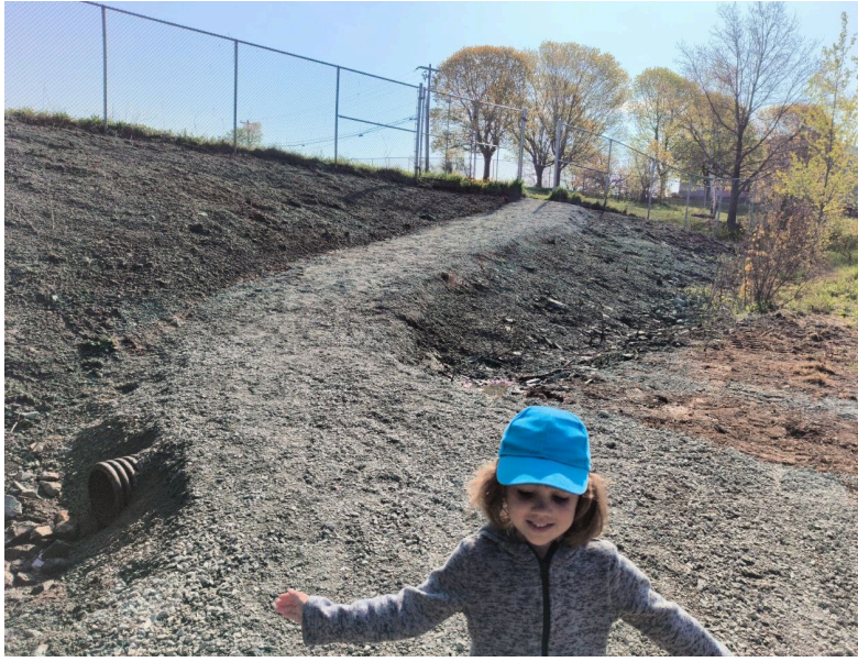
City contractors have already widened the path headed to Dartmouth South Academy and installed a culvert over what was a muddy ditch.